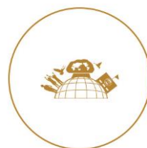
Article 10 – Spreading a culture of peace

Participatory Human Rights Advancement Society joined the Handbook Discussion Project on The Declaration of Peace and Cessation of the War (DPCW) and participated the event by giving congratulatory message.